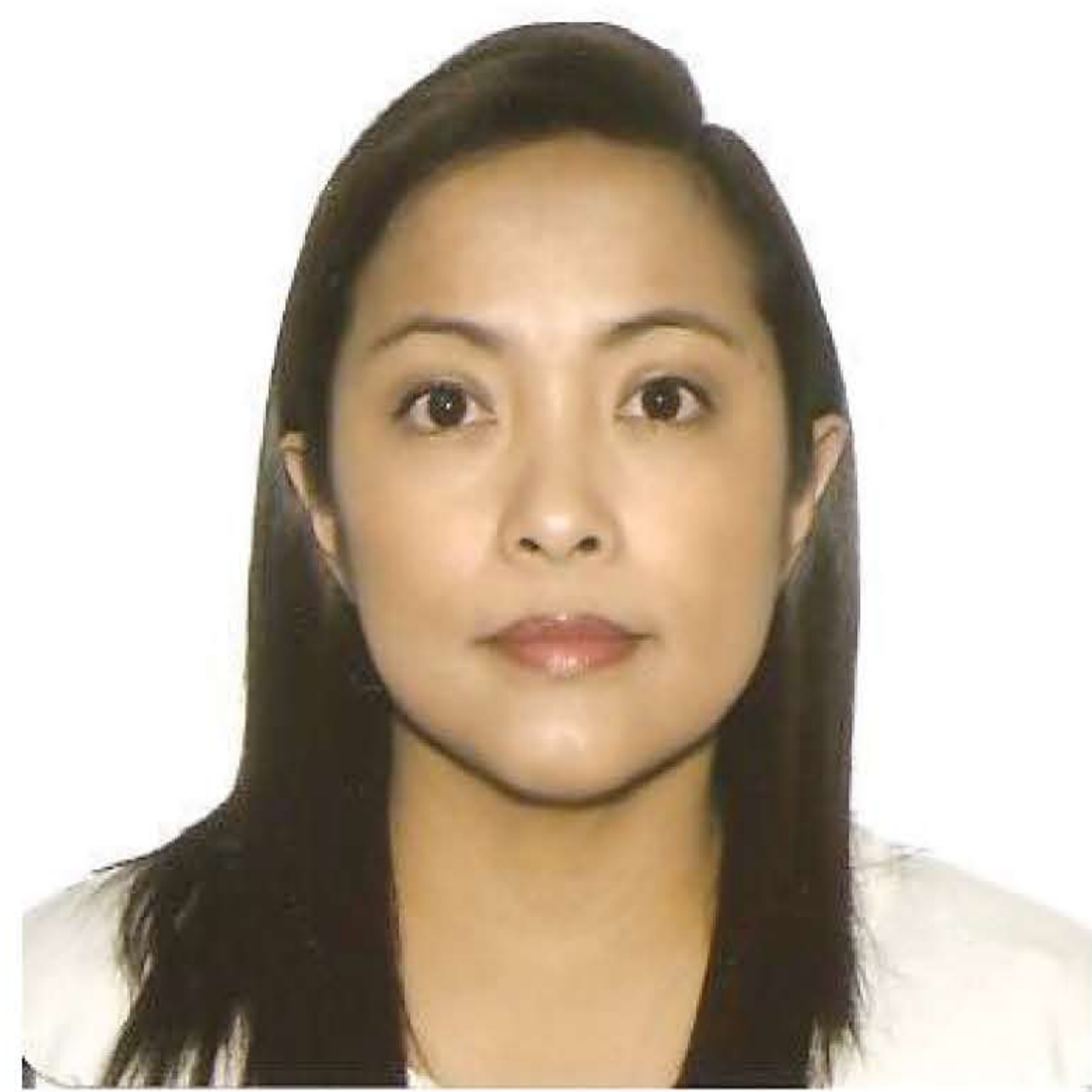
High resolution digital photograph